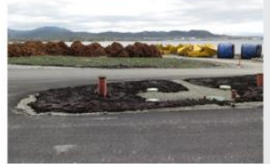
Storage of chain and anchors at quayside