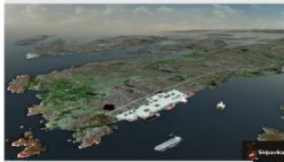
Skipavika offshore supply base