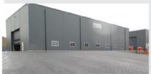
IKM Mooring's new building. Ready December 2014

IKM Mooring Services offshore supply base is located at Skipavika across the fjord from Mongstad. This is a brand new location and tailored for mobilisation & demobilisation of mooring equipment. IKM is located in southern part of base and quays are shaped and tailored for our operations. IKM have a first priority to quays and our building and outdoor storage area are only 50 mtr from quayside.