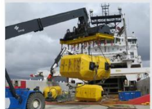
Mobilisation of buoyancy using 50 ton stacker