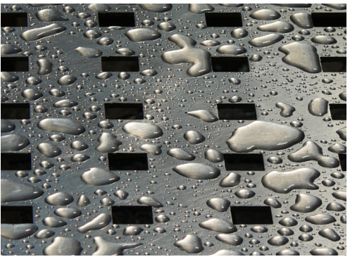
Zerion FAN-5 Part No.

460-F-00006 18 kg pail 136 kg drum 460-F-00006 DR DR