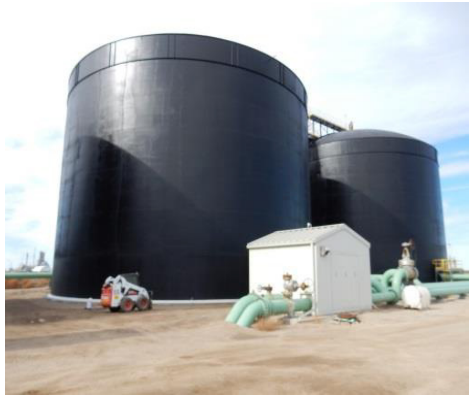
Part No. 350-F-00202PL