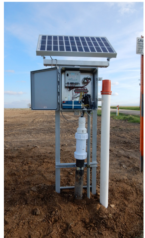
Zerios Conformal Coating can be sprayed onto electrical components to prevent corrosion.

Apply at 45°- 90°F., < 85% relative humidity and at a dew point spread >5°F. Shake can for two minutes after metal ball within begins to rattle. Repeat periodically throughout use. Spray 8 - 12" from surface in an even sweeping motion, overlap successive passes and release button at the end of each stroke. Avoid drips and runs by applying in multiple coats rather than one heavy coat. Clear spray tip after use, by holding can upside down and spraying until only gas is expelled.